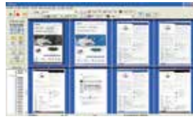
The AVScan X main screen

The Intelligent Document Management Tool