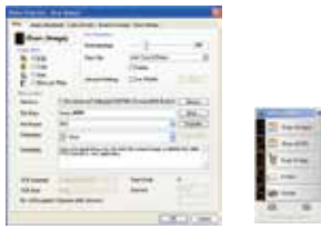
The Button Manager V2 main screen

Button Manager V2 makes it easy for you to scan and send your image to your favorite destinations with a press one button. Now the new version comes with an innovative feature to let you scan and automatically upload the scanned document to popular cloud repositories such as Google Docs, Microsoft SharePoint or FTP. In addition, the iScan feature allows you to insert the scanned image or recognized text after optional OCR (Optical Character Recognition) process to your text editor such as Microsoft Word to get your job done easily and quickly.